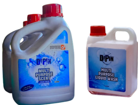
Multipurpose Liquid Wash (1 L & 4L)

Our baby hair and body oil, baby wash and shampoo are gently made with the selection of best ingredients that are not only tender but hygienic and safe for their tender skin and body, we believe in quality.