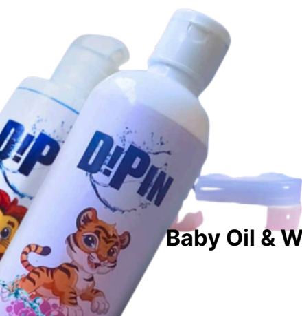
Baby Oil & Wash